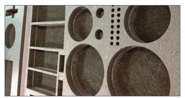
Unlike die cutting, waterjet doesn't compress & damage foam material creating a better product and less material waste

KMT AQUALINE® heads have the fastest reaction times while maintaining long component lifetimes with high quality.