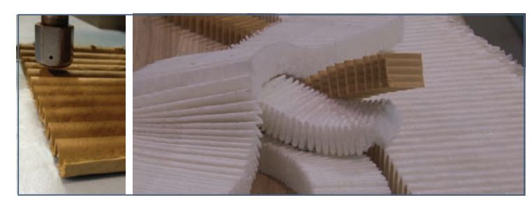
Pure water produces a clean cutting stream thinner than a strand of human hair eliminating water absorption & maintains the paper integrity.